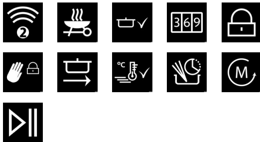
4132_NorCook IH N6326 BK