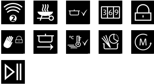
4132_NorCook IH N6326 BK